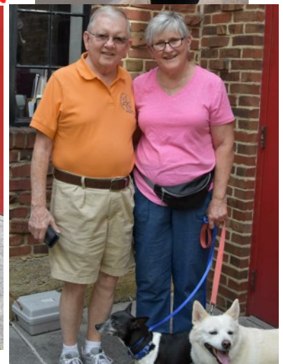
Pet Blessing 2019