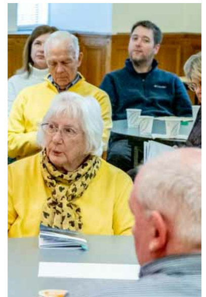
Wednesday in Lent