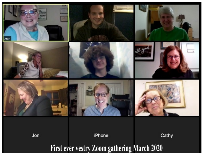
First ever vestry Zoom gathering March 2020