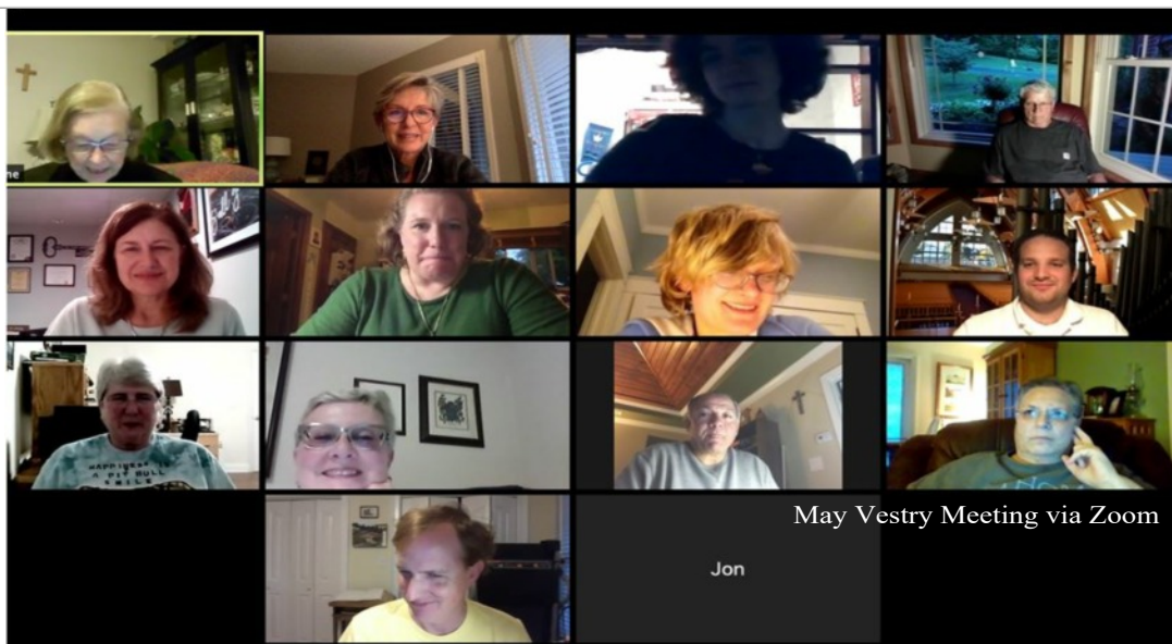
May Vestry Meeting via Zoom