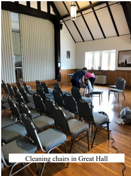
Cleaning chairs in Great Hall