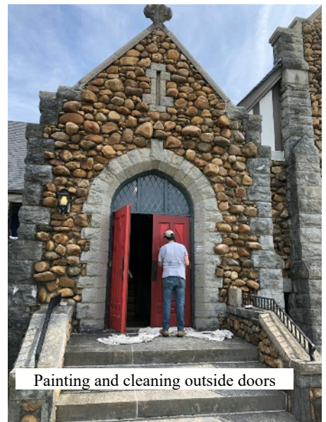
Painting and cleaning outside doors