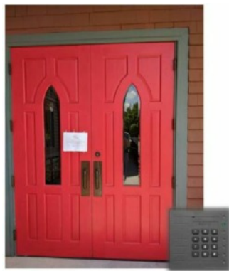
Myrtle ramp entrance

The installation of two keypad door locking devices, first announced in our July 17 th This Week @ St. John's newsletter, has now been completed. Key codes, aka credentials, have been assigned to everyone currently on record as having been issued a door key. When I arrive at St. John's in the morning, or come back in from checking the mail, I find it convenient to not need a key in hand to open the door. I hope you will find this new method to be as convenient as I do!