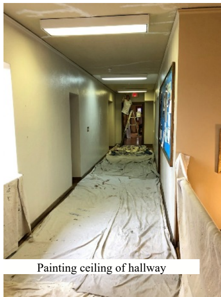
Painting ceiling of hallway