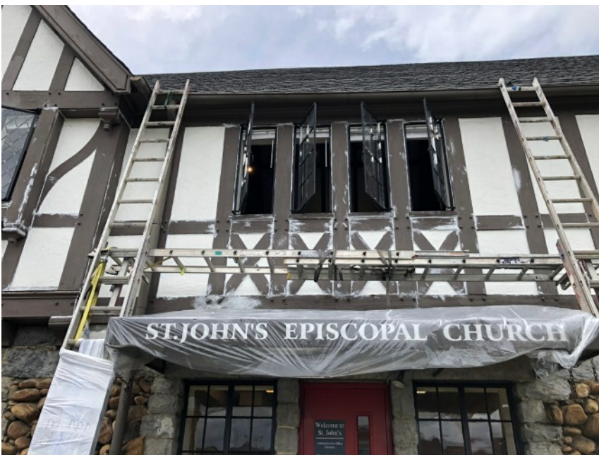
Painting & repairs to Great Hall windows